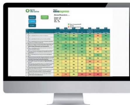
KPI Dashboard showing all KPI's with filterable options

Supplement with Harris Pop Up Communities, or bespoke qual, to add in-depth inputs and insights